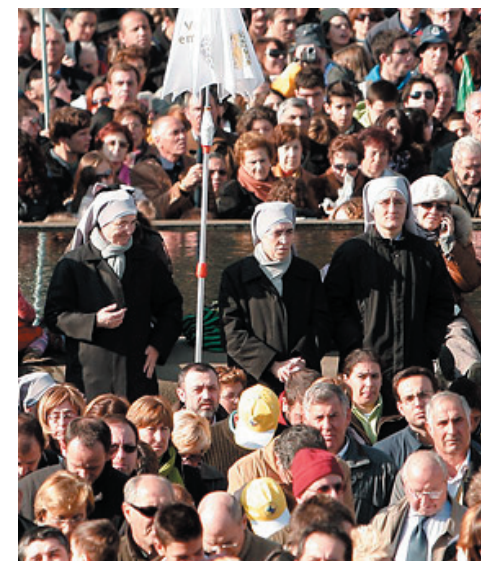
Hundreds of thousands of people gather for a family values protest in Madrid, December 30, 2007

By removing obstacles such as the mandatory year-long separation, the 2005 reform — which some have dubbed “express divorce” — has not only made it easier to end an unhappy marriage, but has made the country’s divorce rate one of the highest in the European Union. For the Catholic